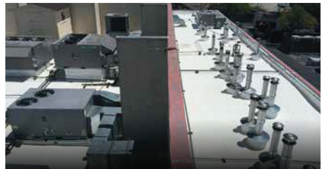
SPF provides self-flashing around all deck-mounted equipment and penetrations for this industrial manufacturing facility.