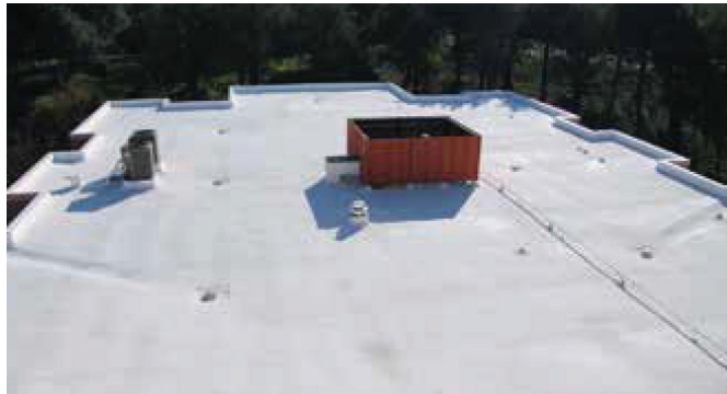
SPF roofing applied promotes enhanced drainage.