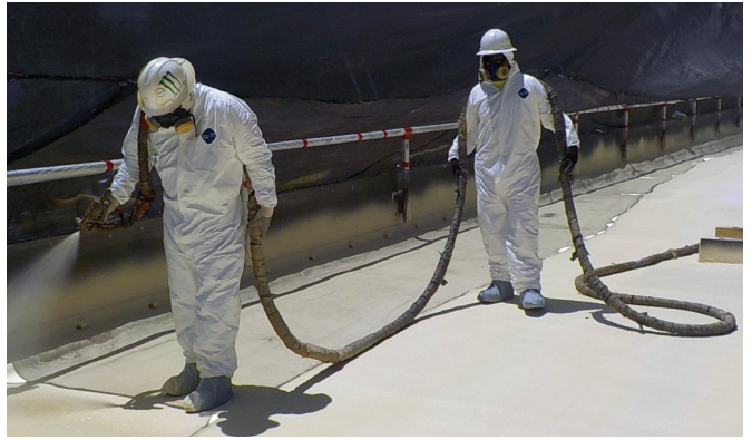
Application of SPF on a low-slope roof.

Elastomeric coatings are typically specified by the foam supplier as part of a SPF roof system and can include acrylic, silicone, butyl rubber, polyurethane and polyurea.