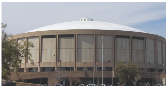
The SPF roof on the Biloxi (MS) Coliseum survived 12 hurricanes since 1979.