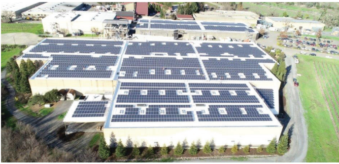
SPF roof with photovoltaic panels at the Rodney Strong Vineyards in Healdsburg, CA.