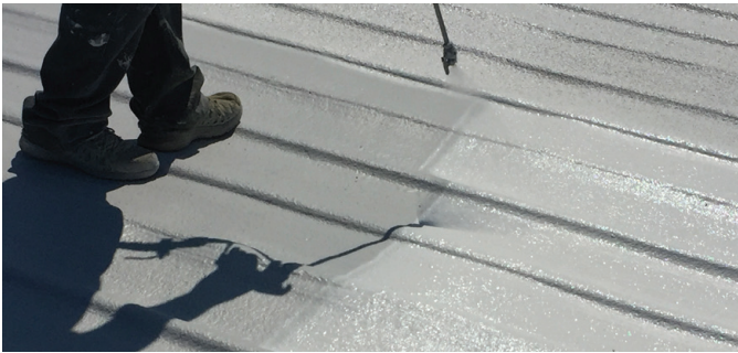
Application of SPF over a metal roof followed by an acrylic coating.