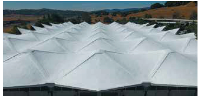
SPF roof installed over an unusual roof design at Birkenstock headquarters in Novato, CA.