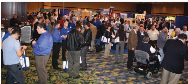
SprayFoam Convention and Expo 2010

21st JMT, Inc. AccuVent - Brentwood Industries ACME Spray Equipment Applegate Insulation BASF Corporation BaySystems BioBased Technologies Certainteed CJ Spray Inc. Coating & Foam Solutions Conklin Convenience Products Demilec USA LLC Diamond Liners Inc. Diimon Spray Innovations Dow Building Solutions Dupont ERSystems FLIR Fomo Products, Inc. Gaco Western LLC General Coatings Inc. Graco Inc. Guardian Building Products Honeywell Icynene Inc. International Cellulose International Fireproof Technology Inc. International Pump Manufacturing Intertek JobPro Technology Johns Manville Lapolla Industries Inc. Lucas Granules NCFI Polyurethanes Neogard No-Burn, Inc. Preferred Solutions, Inc. Premium Spray Products RESNET RHH Foam RK Hydro-Vac Inc. Service Partners, LLC SESCO Granules Specialty Products, Inc. (SPI) Spray Foam Polymers SprayFoam Magazine TTR Roofing International United Coatings/Hydro-Stop Urethane Soy Systems Company Volatile Free, Inc. West Development Group