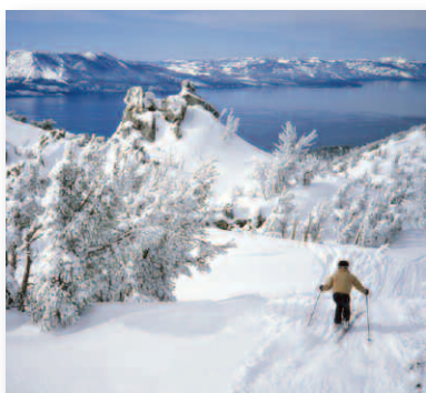
Skiing at Alpine Lake, Lake Tahoe

For more information on Reno and the surrounding area, please visit www.visitrenotahoe.com