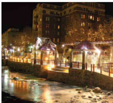
The RiverWalk in downtown Reno