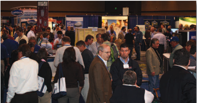
SprayFoam Convention and Expo 2010