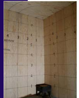
Modified NFPA 286 Test for SPF

This document will provide a background of the issue, as well as a summary of the outcome.