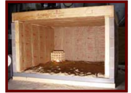
Figure 1—Fiberglass Baseline Test

In 2000, a letter from ICC-ES defined the fire test baseline configuration using fiberglass batts in the SwRI 99-02 test procedure (one of several procedures available). The testing laboratories conducted these tests with the kraft facing towards the fire side of the test module. Spray foam outperformed this product in comparative tests and received approval for this application in Evaluation Services Reports (ESRs). It was later determined that the fiberglass assembly represented a non-code-compliant assembly for baseline testing purposes. The test eventually lost support and a new test protocol was desired.